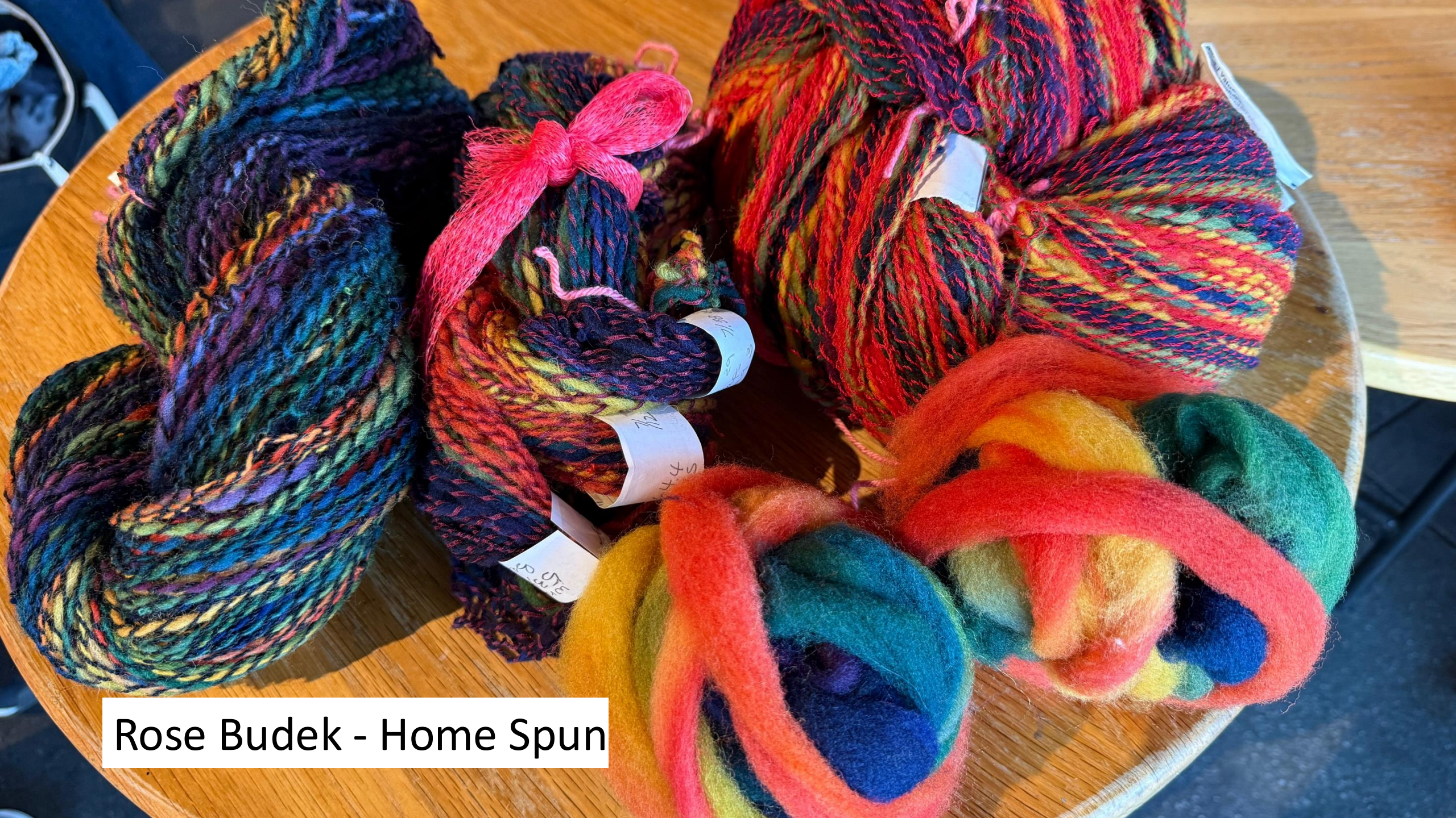
Rose Budek - Home Spun